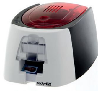
Badgy200 card printer