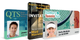
Online card template library