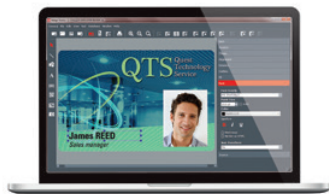
Evolis Badge Studio®+ card personalization software (including import from databases)